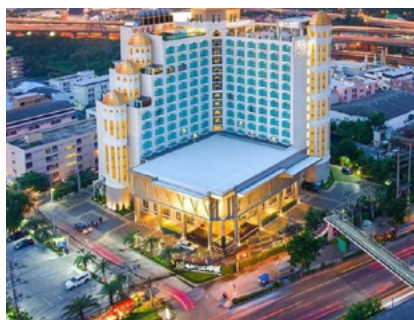
Al Meroz Bangkok (Halal hotel) www.almerozhotel.com