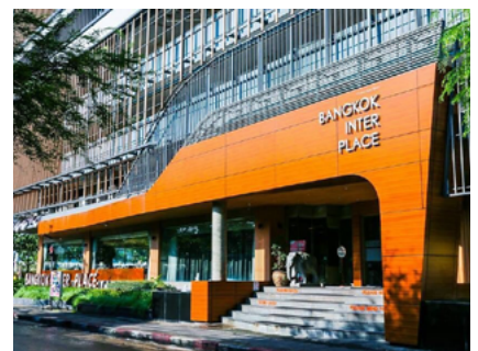
Bangkok Inter Place bangkokinterplace.com

The Alexander Hotel will serve as the main team hotel and will host: